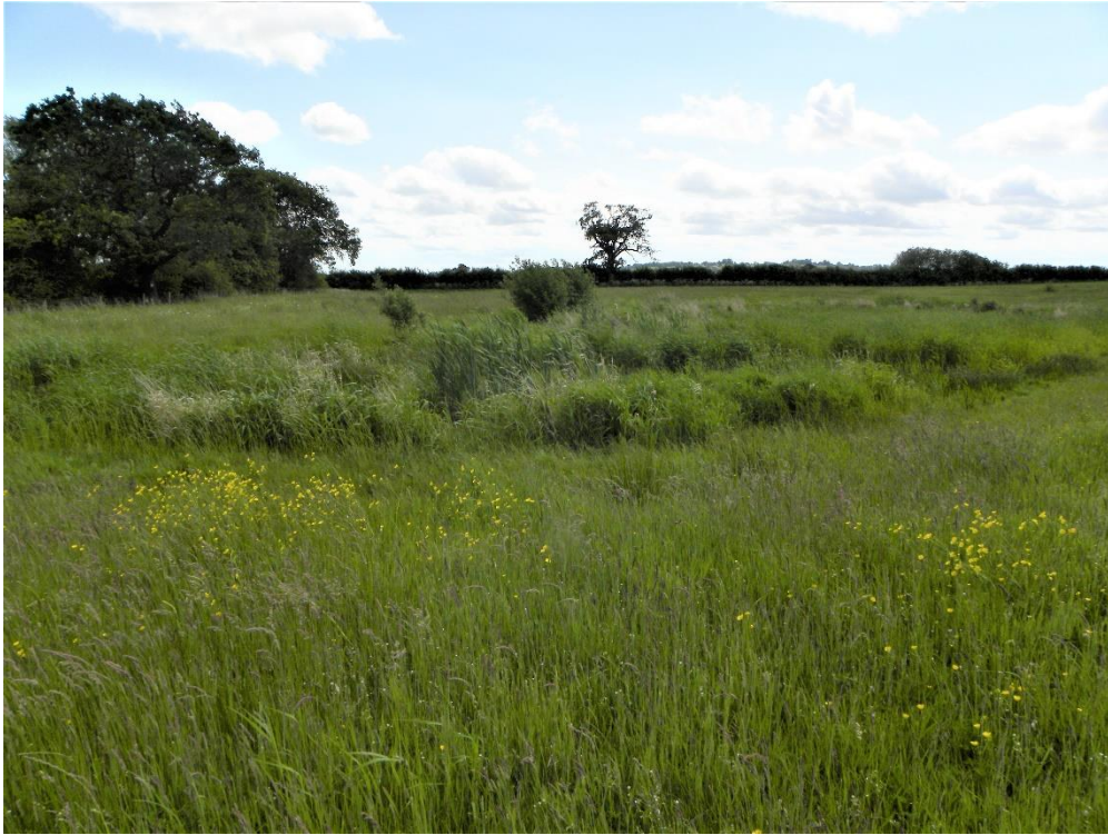
Figure 4. Sepsis fulgens swarm at SJ