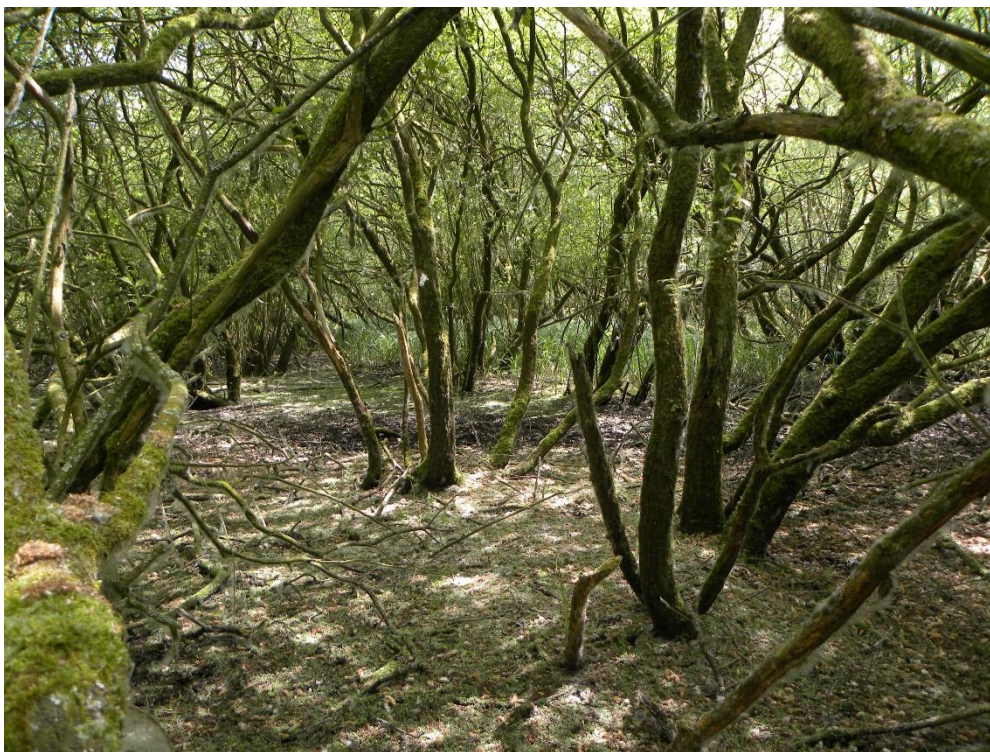
Figure 3. Bickley Hall Farm: marshy pond near Barmere (red square at D in Fig. 1)